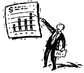
Finance Team Report

During August, the Finance Team will be asking the church committees and teams for their 2012 Operating Budget inputs. Our 2011 Operating Budget is approximately $209,000. We hope to keep 2012's budget close to our 2011 Budget figure. However, we continue to learn about the costs to operate our wonderful new building. For example, the extreme hot and cold weather periods we experienced resulted in increased utility costs.