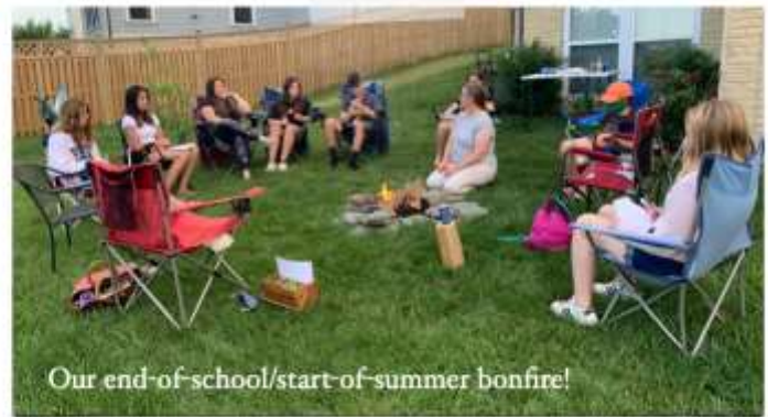
Our end-of-school/start-of-summer bonfire!