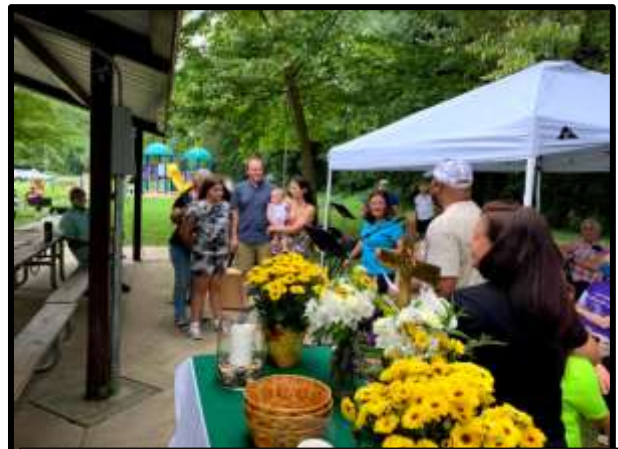
Another picture from our Pinecliff Service to enjoy!