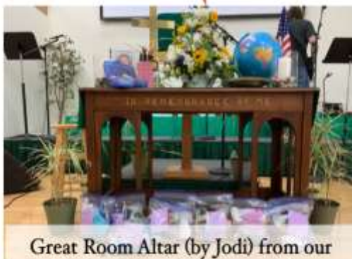
Great Room Altar (by Jodi) from our Back-to-School Blessing on 8/15